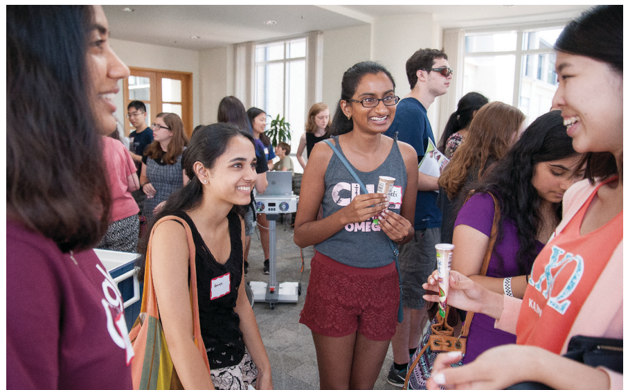
Women comprised more than 48% of incoming first-year undergraduate students at Carnegie Mellon University's School of Computer Science in fall 2016, establishing a new school benchmark for diversity.

By paying close attention to culture and environment, and taking a cultural approach rather than a gender difference approach, our efforts continue to pay off. The percentage of women enrolling and graduating in CS at CMU has exceeded national averages for many years (see the accompanying figure and table). Indeed, the school gained attention when 48% (of the total 166 students), 49+% women (of the total 205 students), and just shy of 50% when 105 women (out of 211 students) entered the CS major in 2016, 2017, and 2018 respectively. a But CMU is not alone—other institutions have also had