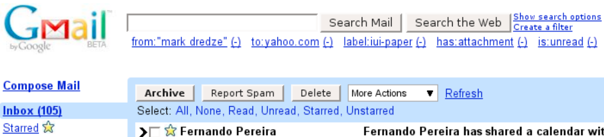
Figure 2: The search operator suggestion user interface for data collection shows suggested operators below the search box.