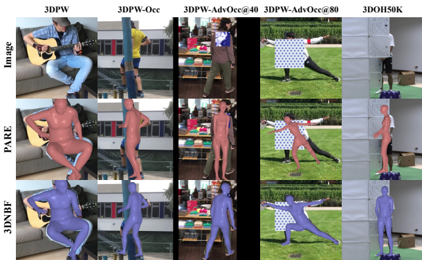
Figure 3: Qualitative results on evaluated datasets.