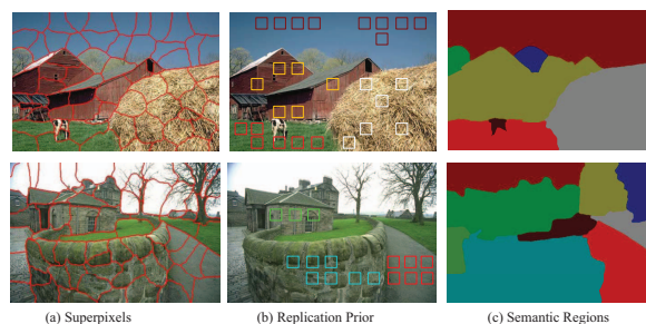
Figure 1. Illustrations of the discriminative internal image statistics. (a) two input images overlaid with superpixel over-segmentation results; (b) repeatedly occurred patches (identified with the same color); (c) segmentation results by our algorithm(unsupevised).

Image segmentation is to partition input image into several semantically consistent regions. It is one of the most challenging and actively studied problems in computer vision. The difficulties are due to the large intra-category variations as well as the ill-posed nature of segmentation. In the past literature, many efforts have been devoted to extra information beyond the input image for solving this problem [17, 13]. Although impressive results and successes achieved, these methods have two major limitations. First, analyzing the statistics of a large number of related images itself is challenging because the low-level visual features are usually not powerful enough. Therefore, the quality of segmentation heavily depends on how well the extra images match with the given image [17]. Second, fully exploring the cross-image statistics is obviously time-consuming and