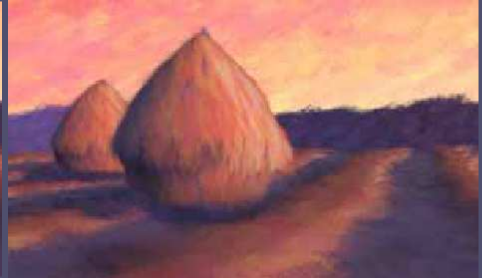
Similar view with random parameter perturbation

from Meier, "Painterly Rendering for Animation, Proceedings of SIGGRAPH 96 , pages 481 and 478.