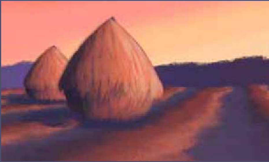
Haystacks without random parameter perturbation