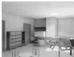
Plate 1: A typical derived frame produced by our test-bed. The reference frames were generated at 5 frames/sec, and the average per-axis position prediction error was 5.0 cm.