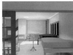
Plate 3: A particularly bad reference frame produced by our test-bed. Some areas of the image near the door were occluded in both reference frames, mostly because of prediction error.

from Mark, McMillan, and Bishop, "Post-Rendering 3D Warping", Proceedings of 1997 Symposium on Interactive 3D Graphics , page 180.