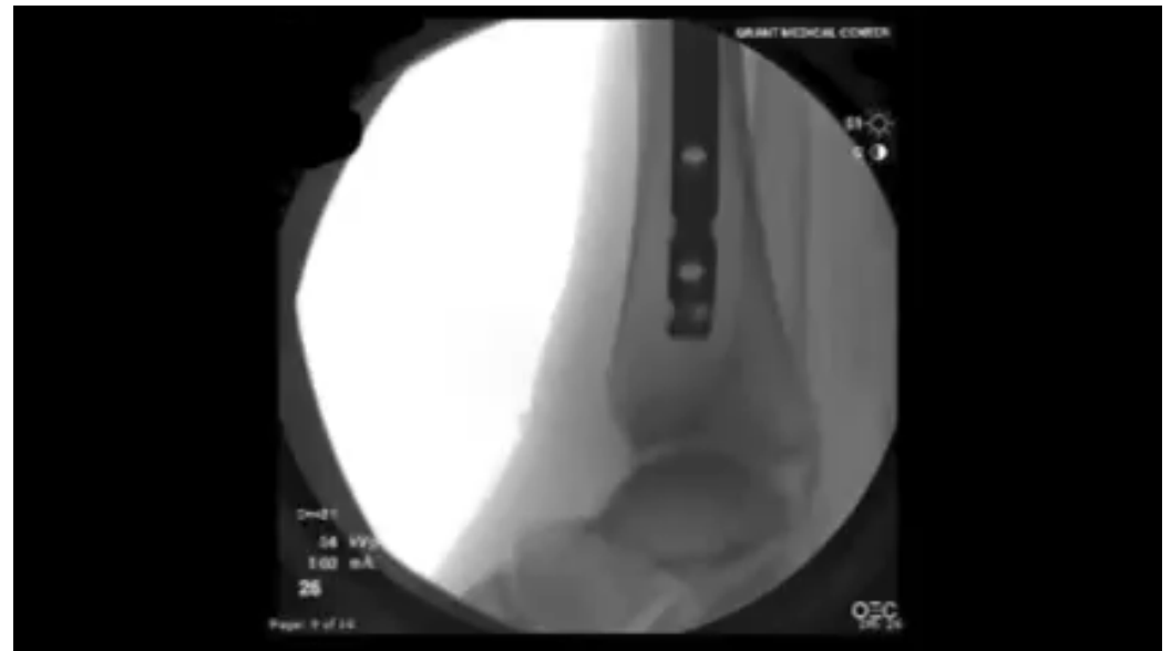
“Perfect circle” x-ray technique

http://www.youtube.com/watch?v=dXHuCo27ZgQ